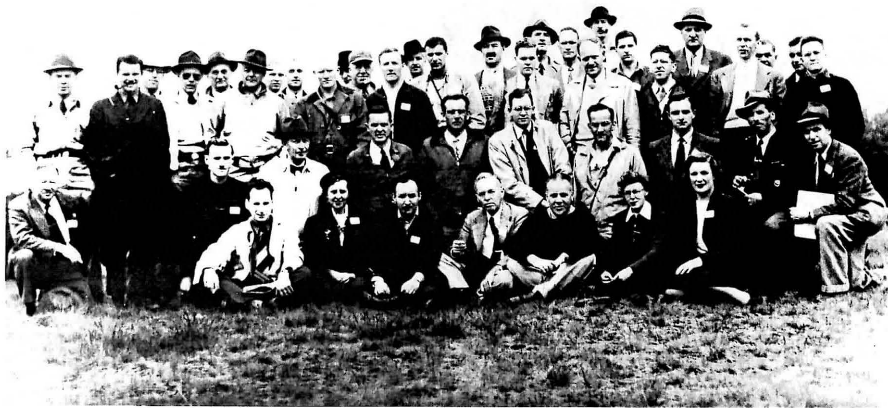
Photograph from Vic Prest taken in Toronto, Ontario, Friends of the Pleistocene , 1948.